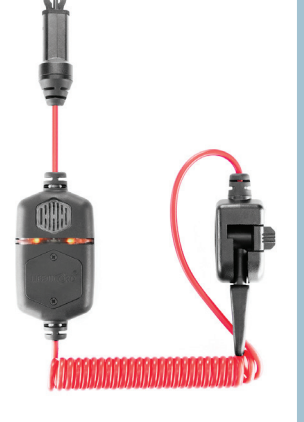
The Lifecord will fit any new or existing boat already fitted with a kill switch

The Lifecord has a the battery enclosure also