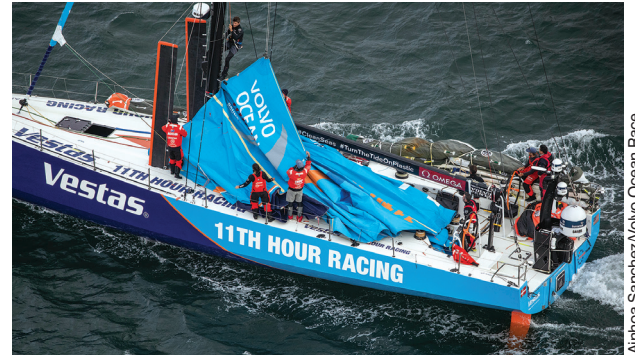
Vestas 11th Hour Racing arriving in Hong Kong after the collision

The Vestas crew also undertook a search and rescue mission, recovering the